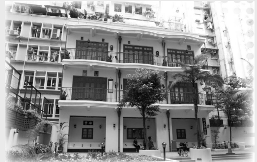
Built in 1938, Wing Fung House was a home to many for 71 years.

All tours are led by experienced guides. For more information and registration details, please visit www.wcna.org.hk/heritagetour .